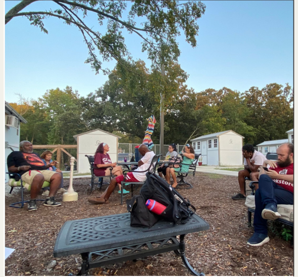
Getting ready for the self-governance community meeting