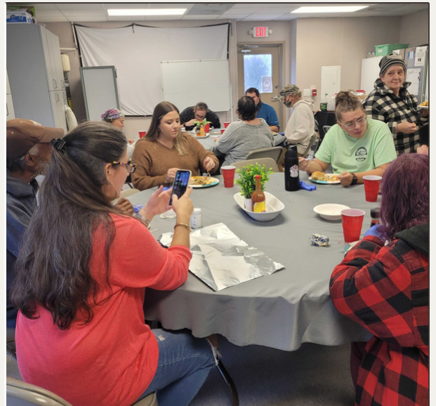
Enjoying a Thanksgiving holiday meal together