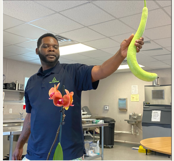
Support staff "Z" holding a NB grown Cucuzza squash