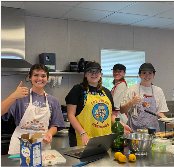
UA Volunteers cooking dinner